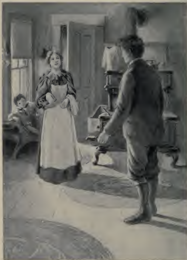
“ROSE À CHARLITTE STOOD CONFRONTING THE NEWCOMER.”